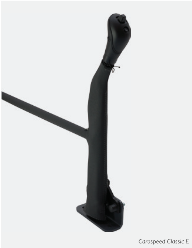
Carospeed Classic E